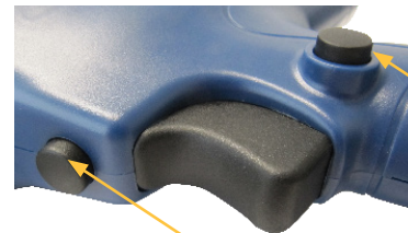
Power Locking Button

Has a dial speed controller to set desired speed and a locking button for continuous flow, allowing for a precise and clean result every time.