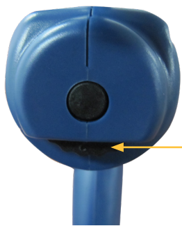
Dial Speed Controller 6 Speeds